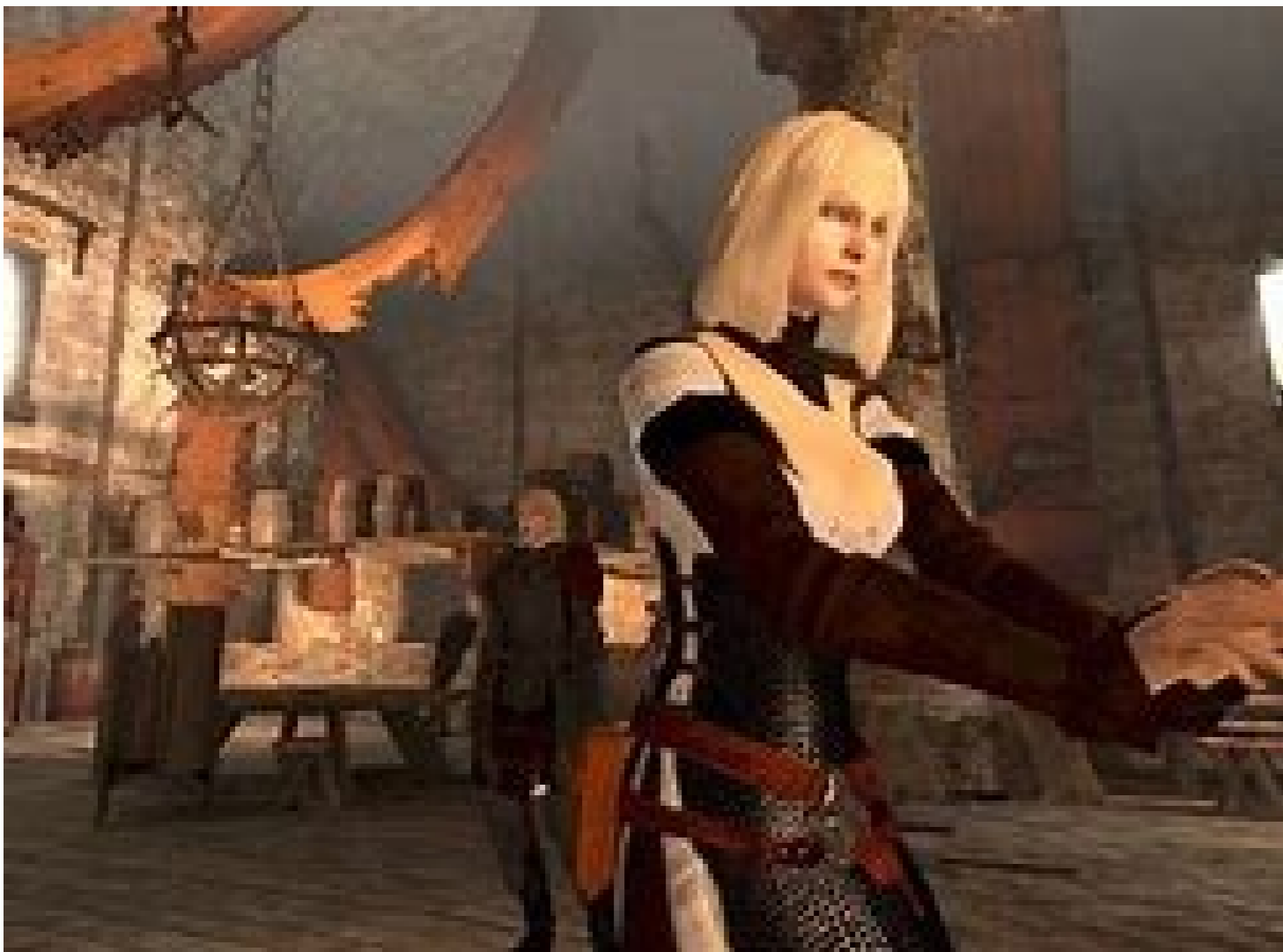
Best bethany build dragon age 2.